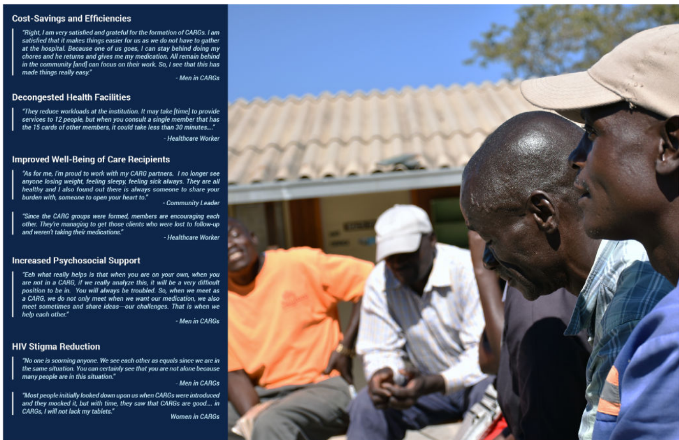
Figure 2. Benefits of CARGs.

intra-group conflict. Other potential sources of conflict included irregular CARG meeting attendance by some members and failure by others to contribute toward transportation costs to the HF as expected.