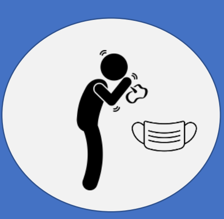
Surgical mask for all clients with cough before they enter the facility