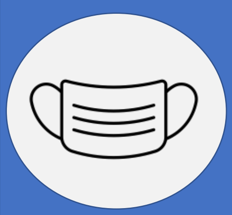
Surgical mask for screening staff

Handwashing or hand sanitizing station should be available at facility entrance