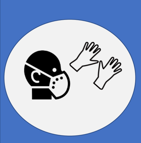
Full protective clothing for HCW that will provide care to a Corona suspect going to isolation