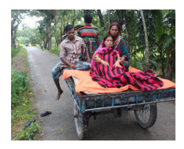
A pregnant woman goes to the hospital for health services in Bangladesh.

A well-informed and empowered patient is also a valuable resource in a high quality health system. However, patients from around the world with various reasons for using the health system report interactions with health workers who withhold information. Given the already vast knowledge chasm that exists between lay people and providers and the close relationship between information and power in healthcare, refusing or failing to share health information strips patients of the little power they may have during a healthcare interaction. The failure to share information is particularly inhumane when it involves invasive physical procedures: