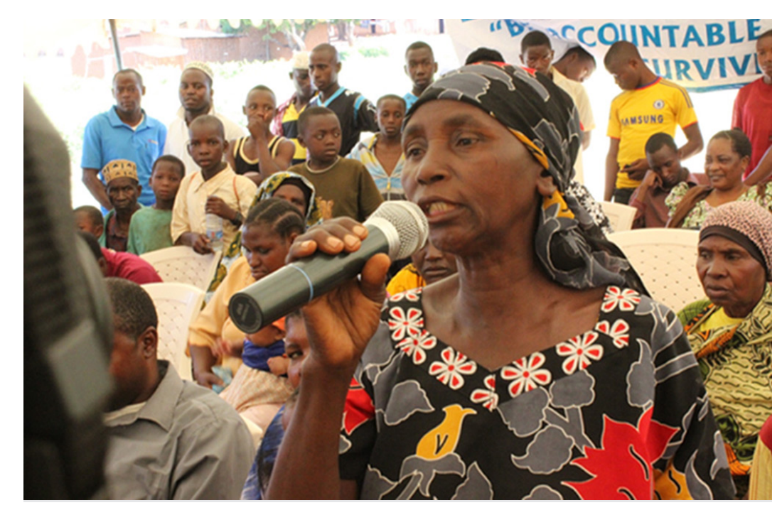
A woman speaks directly to local health officials about her healthcare concerns at a Tanzanian Citizen Hearing.

The following section presents reflections from civil society groups on the Lancet Global Health Commission on High Quality Health System's main conclusions. The primary contributors were the Quality, Equity and Dignity Advocacy Working Group, Walio Katika Mapambano Na AIDS Tanzania (WAMATA), and Support for Advocacy and Training to Health Initiatives (SATHI), three civil society groups that fight for improved quality of care in LMICs. Please see online appendix at <a href="http://thelancet.com/commissions/quality-health-systems">http://thelancet.com/commissions/quality-health-systems</a> for full text from these organizations.