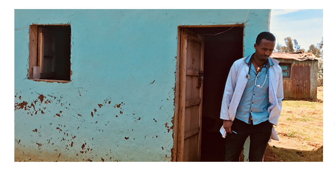
Provider in Chencha, Ethiopia.

This sense of having too much to handle was also noted by a provider in Latin America: "Many doctors and surgeons need to work in three or four places at once, and therefore are not 100% focused."<sup>15</sup>