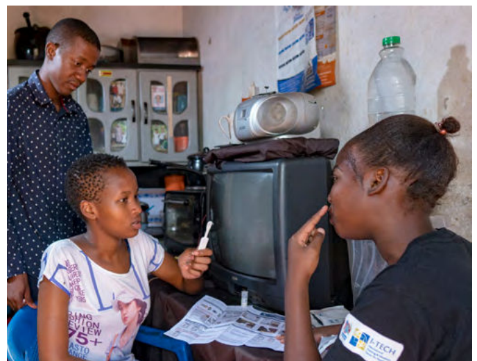
After a counselling session and with permission from the caregiver, a young peer shares information around HIV testing services with another peer.

Some studies work to integrate adolescents and young adults living with HIV from early on: co-development of interventions with adolescents and young adults is becoming a more prominent aspect of these interventions, as researchers and practitioners recognize the importance of equitable, intentional and mutually-respectful youth engagement (50, 51, 52). Importantly, these approaches may maximize acceptability, feelings of satisfaction and value, and attendance and engagement with the intervention.