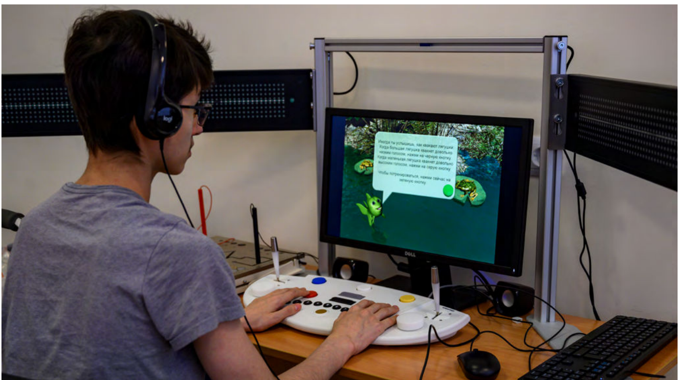
Patient during a Neurocognitive and psychophysiology lab session at the National Medical Research Center for Pediatric Hematology, Oncology and Immunology in the outskirts of Moscow.

Many of the participating young mothers facing isolation, blame and multiple types of stigma also learn of their HIV status during their first antenatal appointment. Linking these groups to facilities enables peer supporters to identify and enroll young mothers at these pivotal moments. In small group settings, peer supporters guide participating young mothers through modules that utilize cognitive-behavioural therapy (CBT) approaches in tandem with components such as psychoeducation and support networking. In some implementation settings, ABCD has moved from being strictly facility-based to a more flexible delivery approach, enabling young mothers to convene with peer supporters where they are most comfortable. Peer supporters also have a supervisor with whom they meet regularly who provides logistical support as well as additional mentorship and debriefing support, as needed.