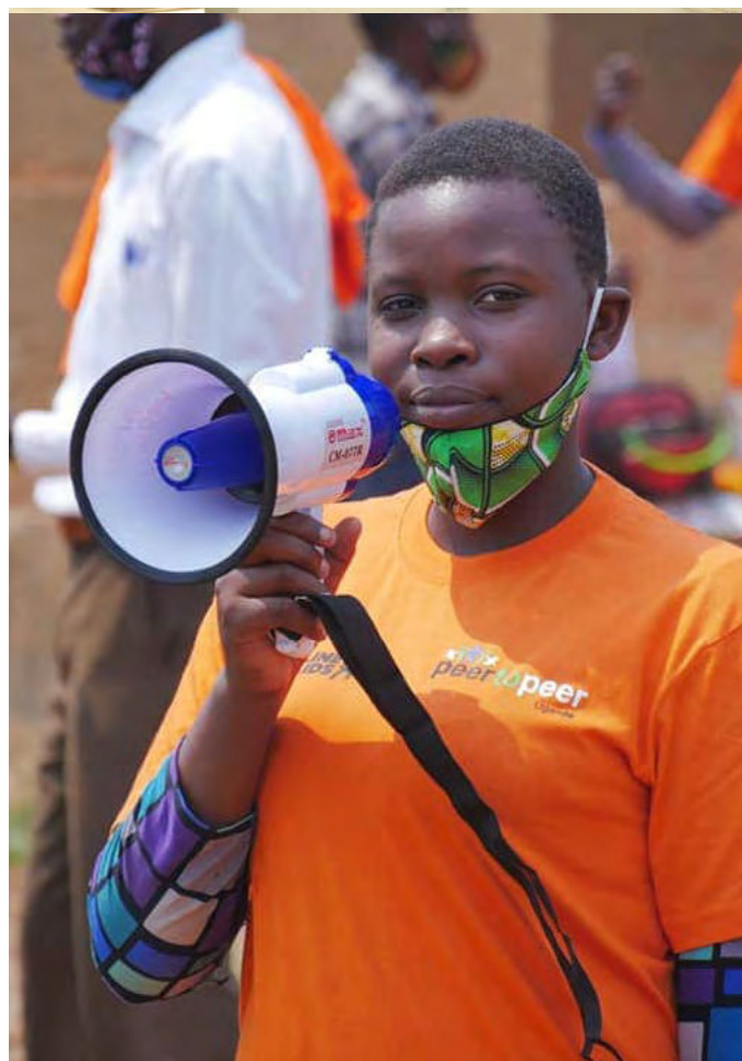
Peer supporter during Covid19 Awareness, 2020

Scale-up considerations should start from early on in the planning and implementation of evidence-based programmes. To effectively expand participation and build buy-in, diverse stakeholders, including representatives from the health, education, justice, social development, finance, civil society, academic and non-profit sectors, alongside community members, should be engaged to map needs and align priorities. Integration should be specifically supported through national strategies and policies, and within results-monitoring frameworks.