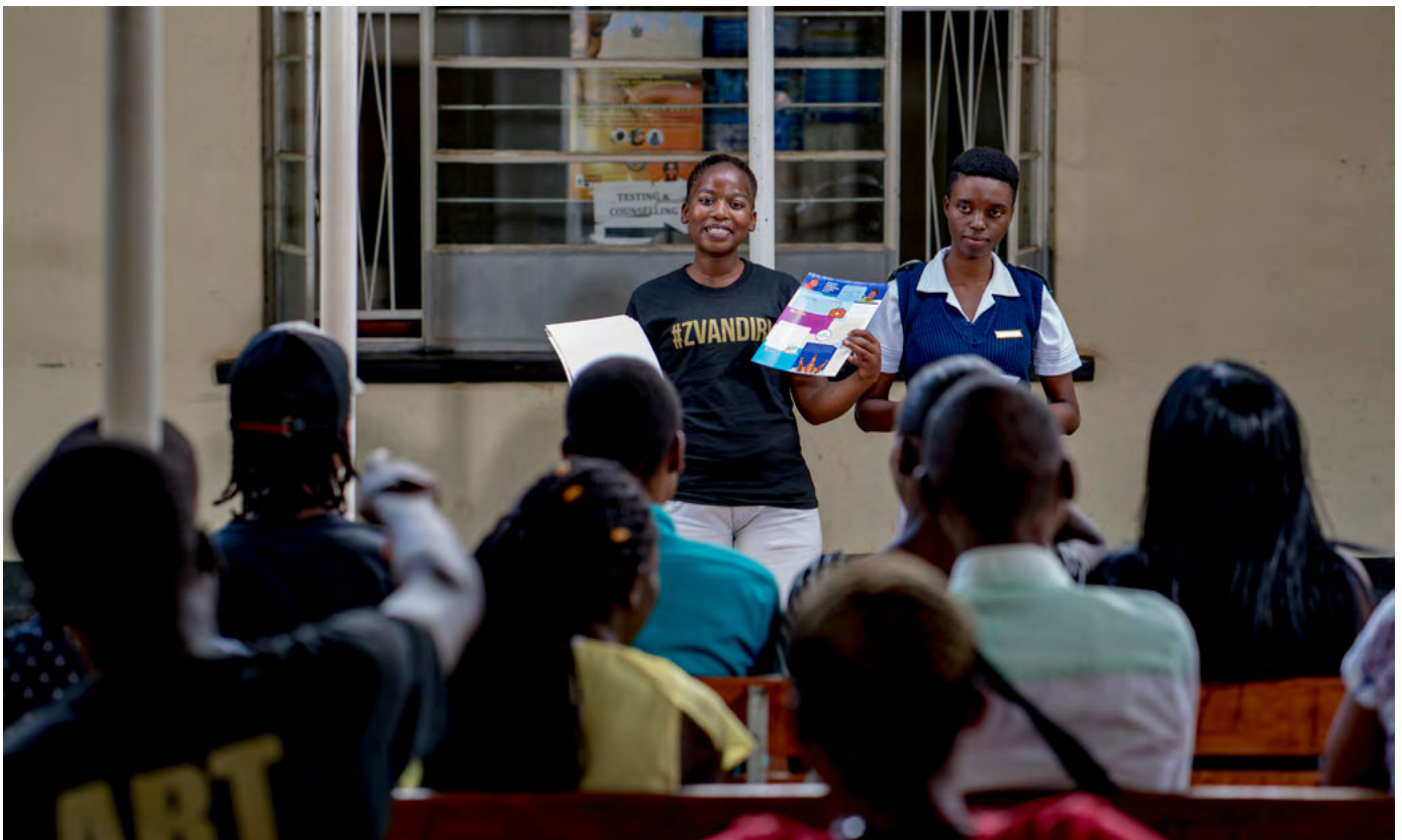
During an adolescent ART refill day at the clinic, young peers and a nurse use adolescent-focused fact sheets and group discussion to share information with other young people

There is a well established link between mental health and HIV outcomes. Poor mental health can directly affect the health and well-being of adolescents and young adults living with HIV by negatively affecting their ability and motivation to seek health care and to be retained in HIV care. HIV-associated mortality has declined at a slower pace in adolescents than in other populations, highlighting the significant and dire consequences of treatment interruptions and inadequate support for care, monitoring and adherence for this population (9). For adolescent girls and young women who become pregnant and give birth, these impacts can also extend to their children (10, 11). Evidence shows that younger mothers are at significantly higher risk of mother-to-child transmission of HIV than are older mothers (12, 13).