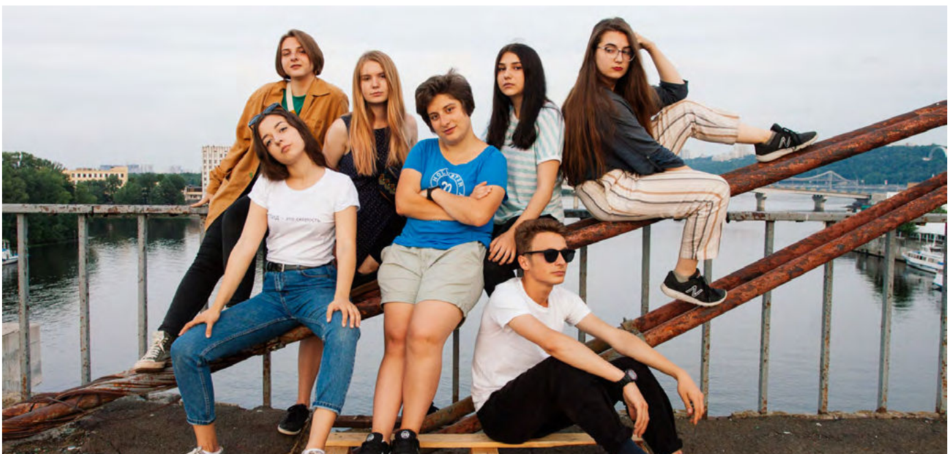
Group of young friends in cool pose, standing and sitting on pallet and metal bars, in front of railings by an urban waterfront.

“I could not face the society and the self-stigma was always around me, but I got support and somebody sharing her own experience and monitoring me, making sure that I attend the support groups. When my date for resupply was near, they would remind me. Psychosocial support (PSS) really helps adolescents living with HIV.” (WHO Values & Preferences Report, Zimbabwe)