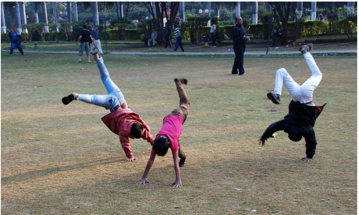
Adolescents doing cartwheels in a park

Mental health promotion and prevention is thus a critical priority for this group. Psychological and clinical services for mental health are out of reach for many of the world's adolescents and youth, especially in the countries and settings most affected by HIV. Broader-based interventions have greater potential to reach adolescents and young adults living with HIV at scale and to be tailored to their specific needs. Psychosocial interventions have the potential to support healthy behaviours, bolster mental health and lead to improvements in physical and mental health for this group (18, 19). These interventions can also play a role in preventing or mitigating mental health disorders. While these are critical strategies for supporting the mental health of all adolescents and young people, they are especially important for adolescents and young adults living with HIV, given their distinct experiences and the additional stressors they manage while living with chronic illness.