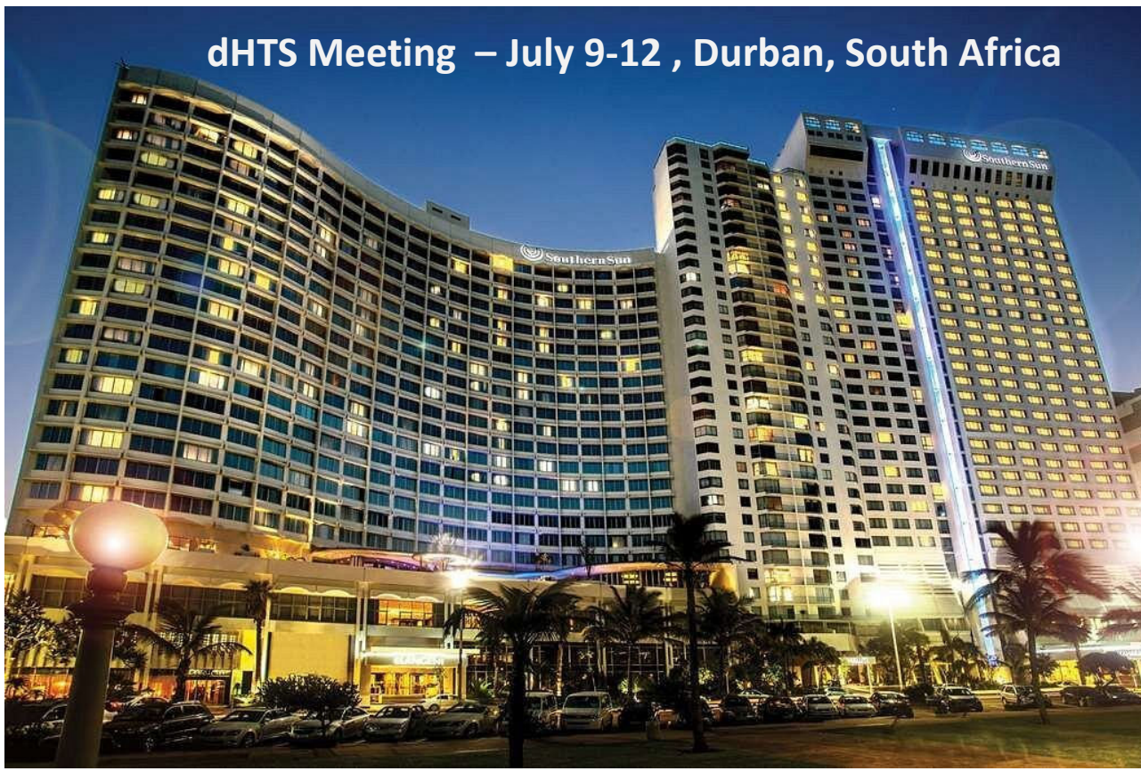
dHTS Meeting – July 9-12 , Durban, South Africa