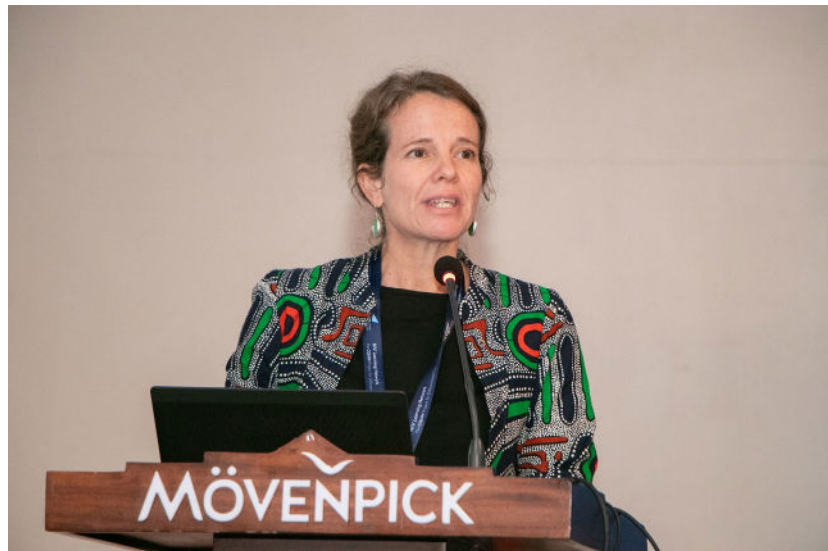
...ces into HIV Programs