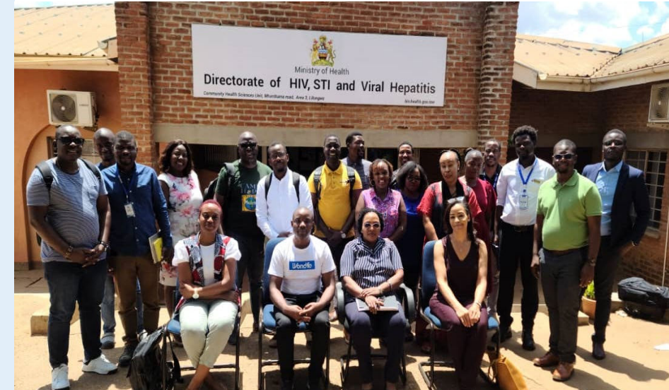
Mozambique visit to Malawi, November 2023